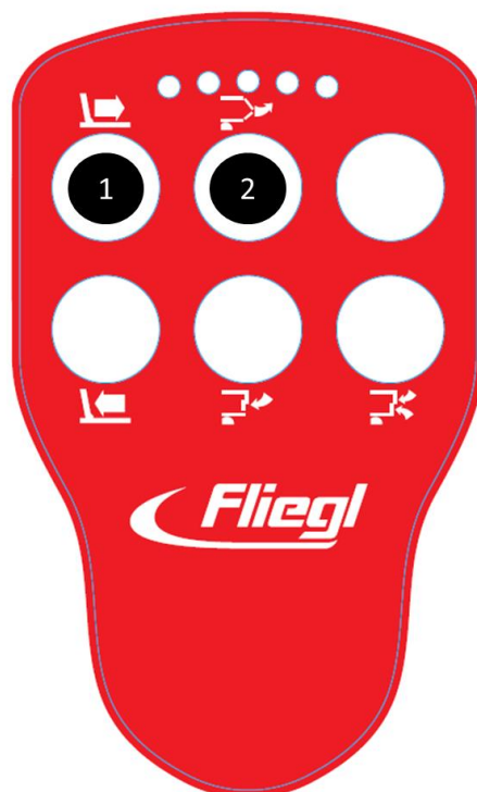
Figure 3: transmitter